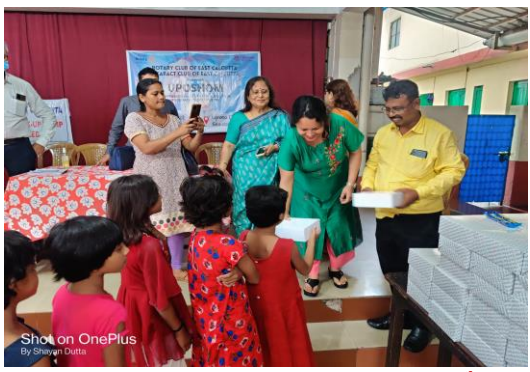
Food Packets Distribution at Uposhom on 24<sup>th</sup> July 2022