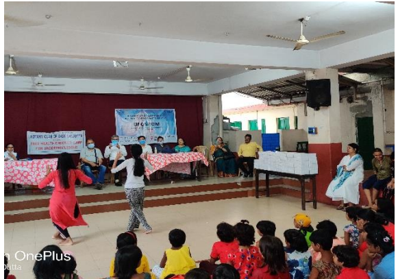
Glimpses of Uposhom – Free Health Check Up Camp on 24<sup>th</sup> July 2022